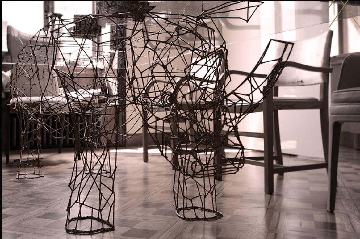
TABLE LIMITED EDITION 9 colors for 9 products in the world